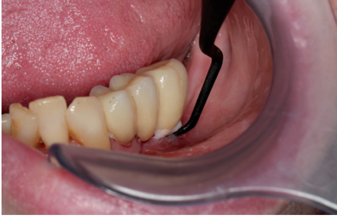
Fig. 4 Removal of the cement residues

Fig. 4 shows the removal of the cured cement residues which were removed with a scaler made of a glass-fibre reinforced special resin. It is of special benefit, that the removal of the material residues proves to be easy and effortless in whole, homogeneous pieces.