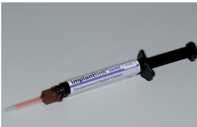
Fig. 1 implantlink semi Xray

placed an implant-supported bridge in regio 34-36, leaving the residual cement in place on purpose. The residues in the distal region as well as between the implant-supported bridge crown can be seen clearly. The new implantlink® semi Xray thus permits clear visibility of the residual cement to avoid peri-implant inflammation.