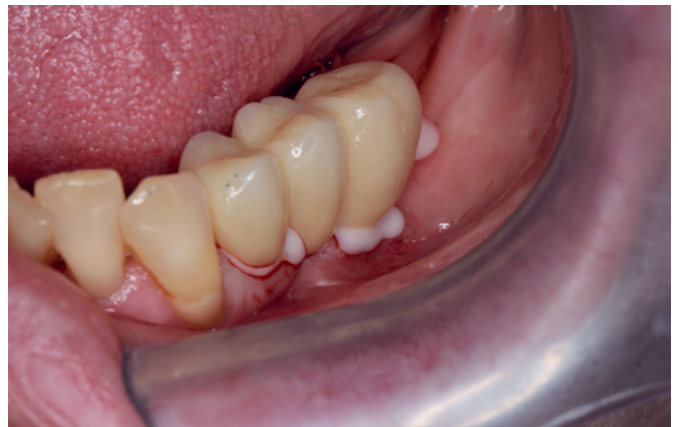
Fig. 2 Integration of the superstructure

To confirm this benefit, we participated in a trial series with the new implantlink® semi Xray . In the following case we